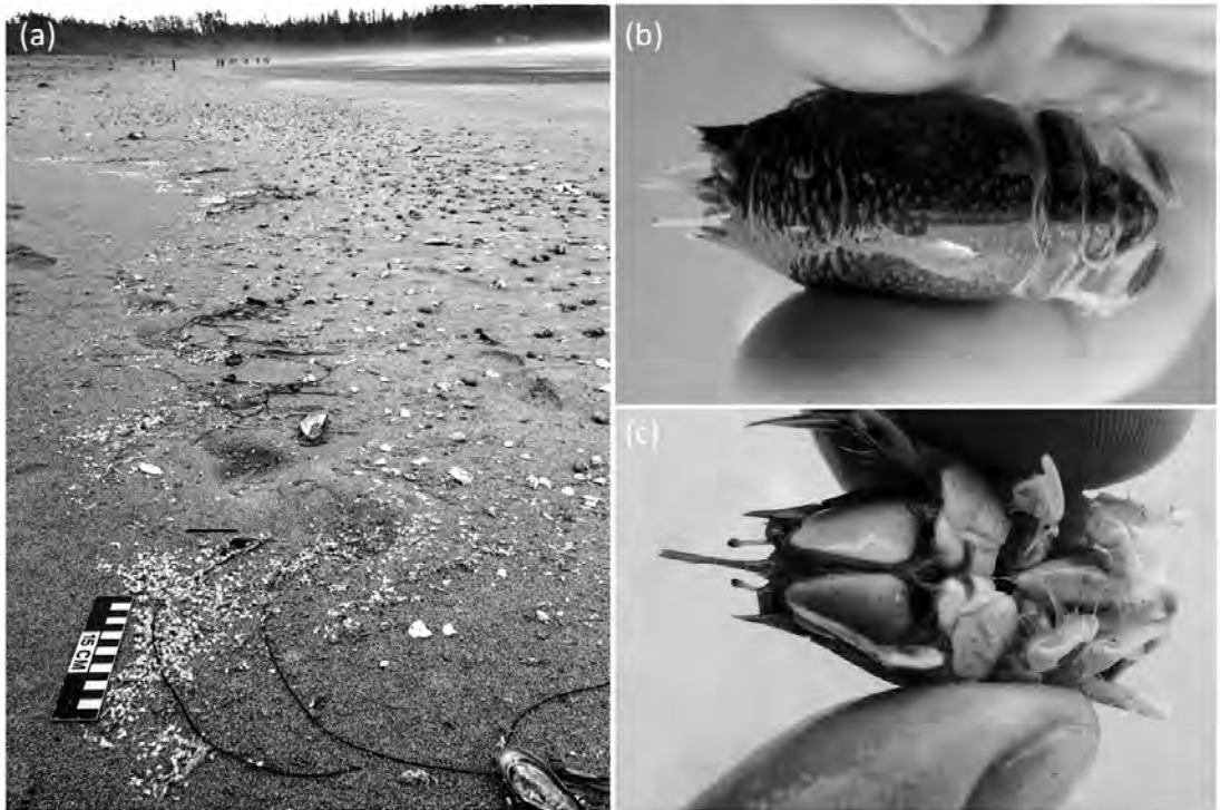
Figure 1. Pacific sand crab ( Emerita analoga ) on Long Beach, British Columbia, 2016, showing a) adult and juvenile molts along the strand line, b) live gravid female dorsal view, c) ventral view.